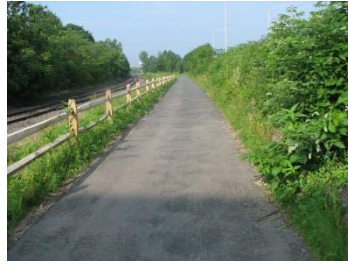
MULTI-USE TRAIL PROJECTS

The firm has previously acted as Municipal Engineer and/or completed special projects for many other area municipalities.